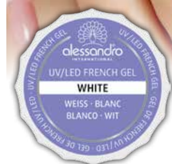
Before: French Perfect White

The 1990s trend is celebrating its grand comeback this year, and countless celebrities have been seen spotting white nail tips again. The best thing about it is that you can let your imagination roam free – whether long or short, stiletto or round, classic or freestyle – everything works. Create your own style.