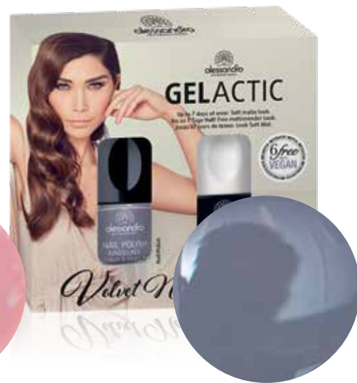
Gelactic MATTE Set Stay With Me Ref. no.: 21-355