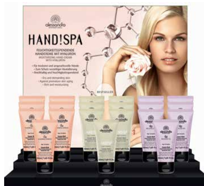
Hand Spa Display contents 3 x 6 units / 50 ml Ref. no.: 50-847

An elegant, refined fragrance with lychee and vanilla.