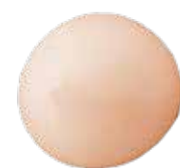
HAND SPA Cream Rich FLAVOURFUL APRICOT

A and C protect and nourish. Hyaluronic acid boosts moisture and makes even the roughest skin silky-soft again.