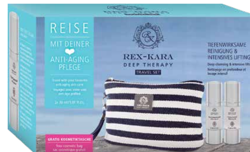
Rex-Kara Deep Therapy Travel Set 1x Hydra Active Cleansing Gel 30 ml 1x Youth Spectacular Lifting Serum 30 ml 1x Cosmetic bag