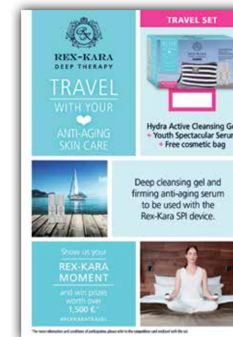
Counter Card A4 Inspire your customers to buy the Rex Kara Travel Set; we will provide you the suitable counter card for that. Ref.-Nr.: 21-364 F/GB 21-365 NL/FR