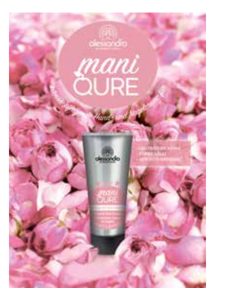
Poster DIN A1 Ref. no.: 12-369