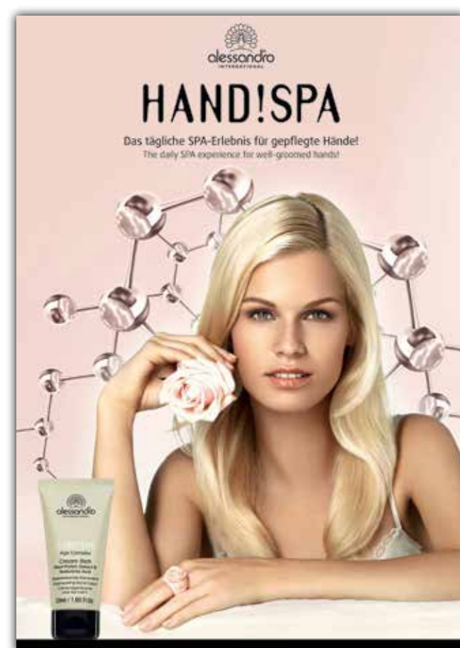
Hand Spa poster with decorative rail Ref. no.: 12-382