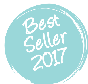
Tester Ref. no.: 04-124