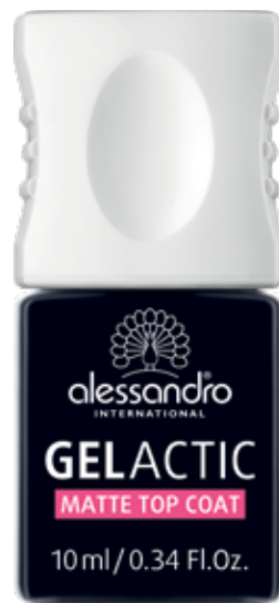
GELACTIC Matte Top Coat Ref. no.: 76-214