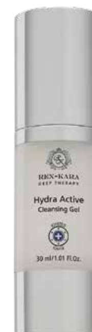
Cleanses deep into pores Intense, deep cleaning

beauty expert, REX-KARA has designed a handy travel pack with two products you can't leave without: HYDRA ACTIVE CLEANSING GEL and YOUTH SPECTACULAR LIFTING SERUM .