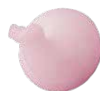
HAND SPA Cream Rich DELICIOUS FIG

With echoes of fresh peach and blossom, let spring begin.