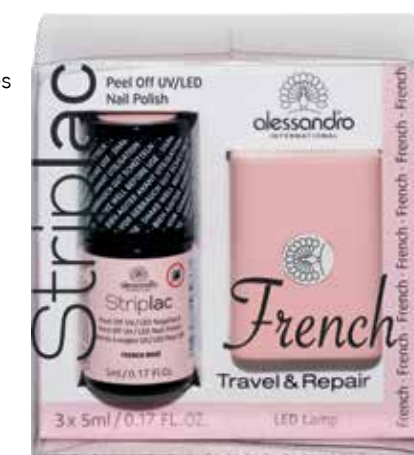
STRIPLAC Limited Edition Ref. no.: 78-768