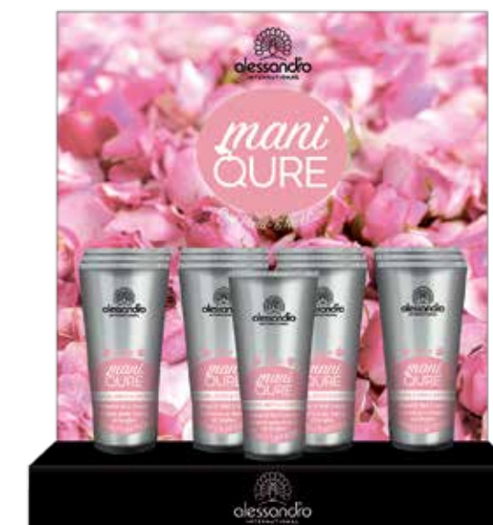
Rose en Fleur Display Content: 9 x 50ml + Tester Ref. no.: 50-841