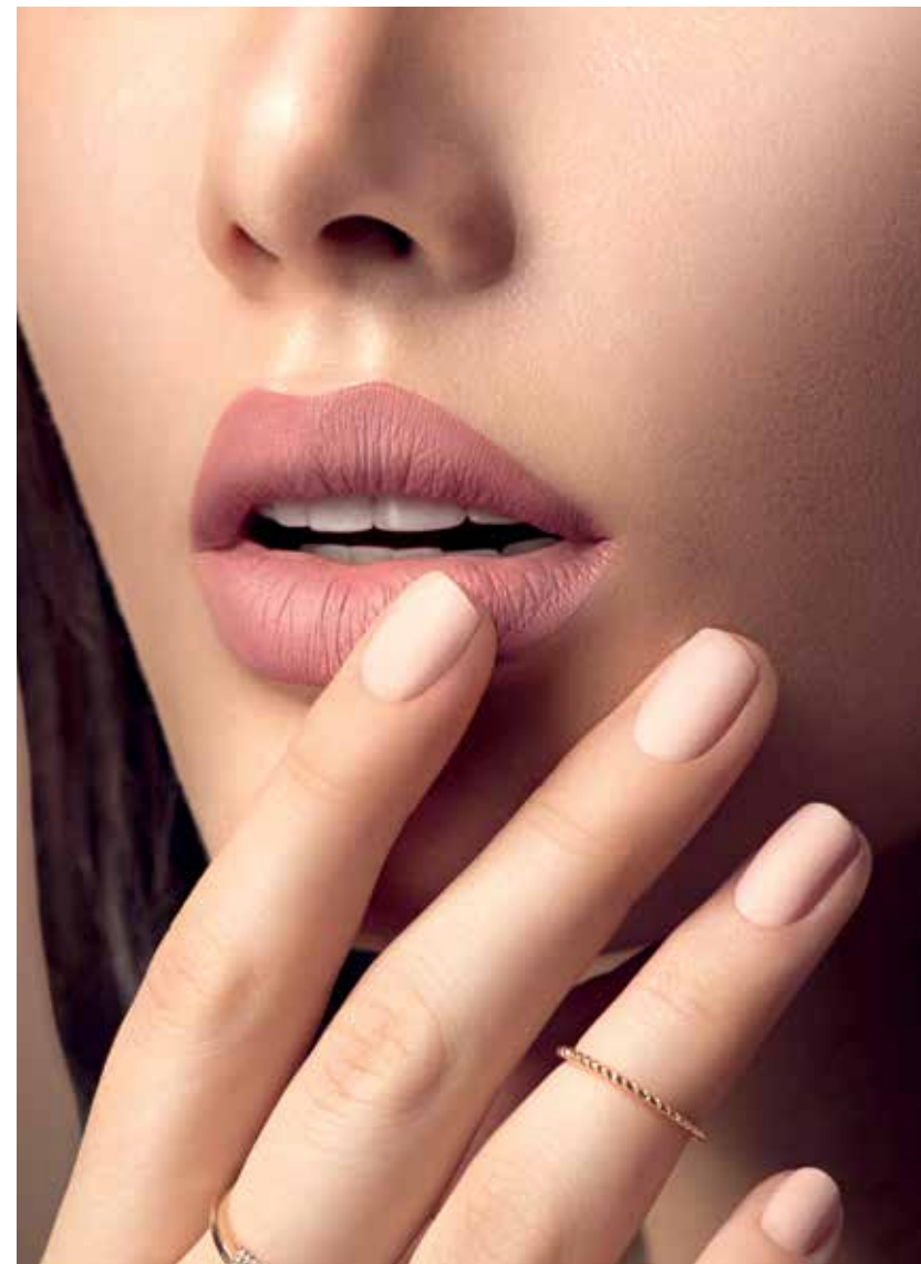
GELACTIC Matte Tester Ref. no.: 76-314