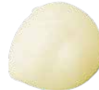
HAND SPA Cream Rich ORIGINAL

A fresh, slightly tart fragrance reminiscent of green herbs and fig.