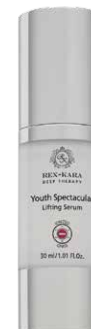
Intense firming The skin feels wonderfully fresh and smooth

Hydra Active Cleansing Gel (+) Ionised gel for channelling into the skin with the SPI device. The deep cleansing effect of the active ingredients frees the skin of pollutants, impurities and excess sebum.