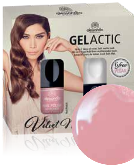
Gelactic MATTE Set Dried Rose Ref. no.: 21-354

fashionable look. Impress your clients with these two trends. The top-selling colours from the spring collection combined with Gelactic MATTE Top Coat achieve an on-trend look that is quick and easy to create.