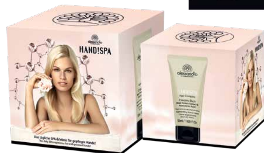
Hand Spa decorative cube Ref. no.: 12-383