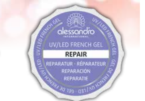
Before: French Perfect Repair Milky White